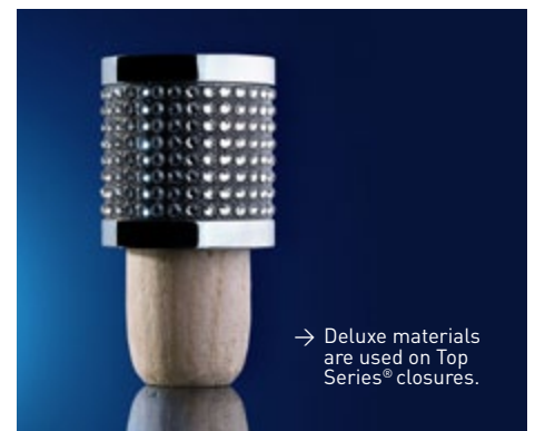
→ Deluxe materials are used on Top Series® closures.

Amorim responds to specific needs by developing innovative customised solutions that allow customers to differentiate their packaging as evident in the unique closure solution presented to Gordon & MacPhail.