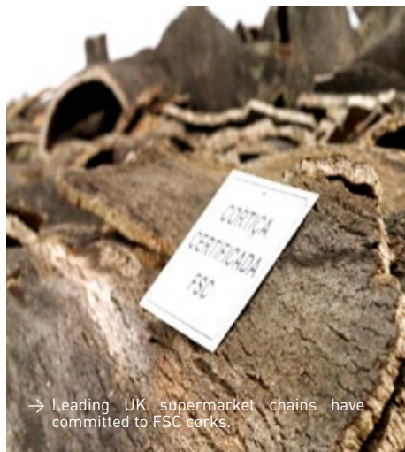
→ Leading UK supermarket chains have committed to FSC corks.

The Co-operative Group intends to continue working with its supply base to