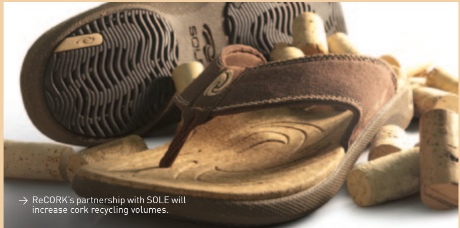
→ ReCORK's partnership with SOLE will increase cork recycling volumes.

Visit the new ReCORK website at www.recork.org