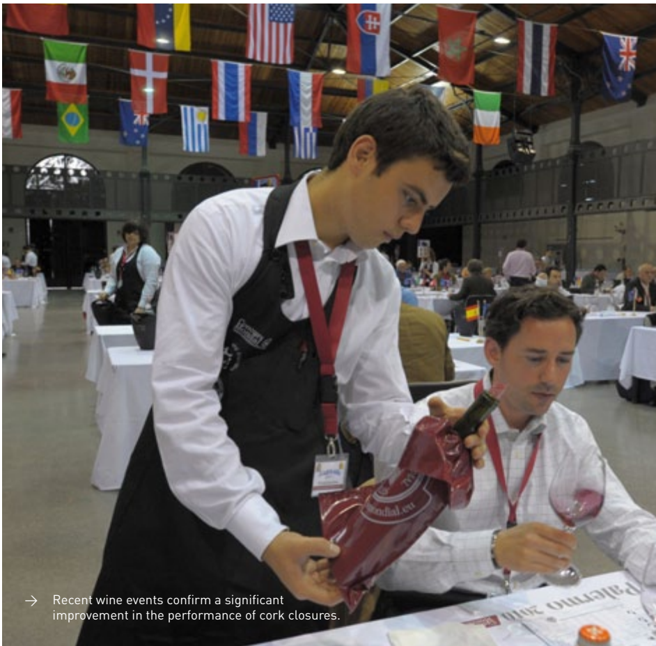
→ Recent wine events confirm a significant improvement in the performance of cork closures.

"The industry has made great progress on TCA and some of cork's loudest critics are now recognising that and quietly acknowledging cork's improved performance."