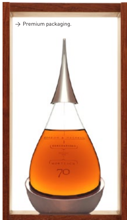
→ Premium packaging.

The whisky has aged since 15 October 1938 in an ex-bodega sherry hogshead cask made from Spanish oak.