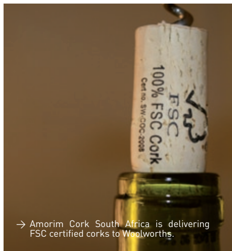
→ Amorim Cork South Africa is delivering FSC certified corks to Woolworths.

"Factors such as cork's low carbon footprint and certified sustainability are very much part of our Good Business Journey. Using FSC corks underscores our commitment to responsible business practices, which we want our customers to be part of, as well as helping to change the way people buy and use materials in general."