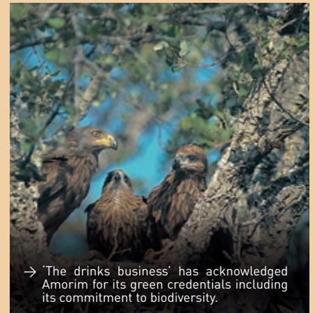
→ 'The drinks business' has acknowledged Amorim for its green credentials including its commitment to biodiversity.

For further information on Amorim's green credentials visit www.corkfacts.com