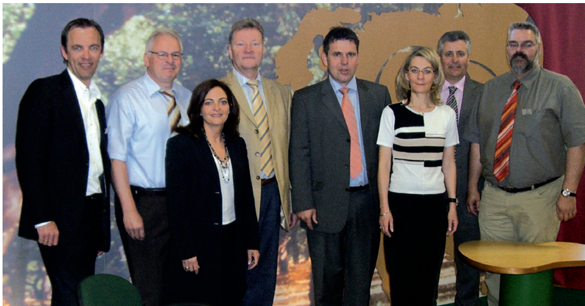
Amorim Team at the fair