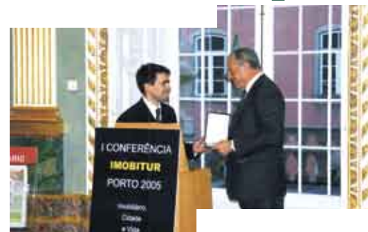
Américo Amorim receiving award

The strength of Amorim Imobiliária lies in its knowledge of the market and its strategic business vision, in the diversity of projects and in a vast portfolio of quality and innovation. Its success is recognised at international level and is reflected through its partnerships with prestigious and solid worldwide Groups.