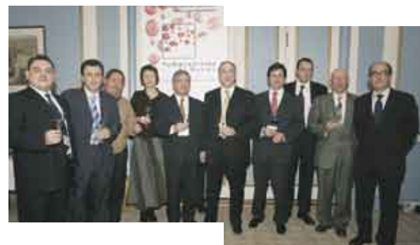
Some of the participants at the Travelling Contest, help in Copenhagen

Throughout the 3 days of the contest, which each year will take place in a different country, the organisation convened a panel made up of five tables, at which sat renowned Spanish and foreign wine tasters, journalists and sommeliers.