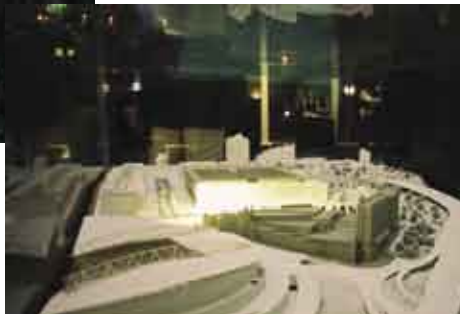
Model of the “Antas Première” enterprise

Encouraging the resumption of old friendships, this event was a huge success, where the small details made all the difference.