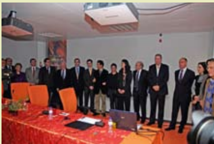
Individuals in charge of all the bodies involved in the project.

On 10 November, at the YDreams headquarters in Costa da Caparica, a presentation was given on Invisible Network (IN), a network of companies working on developing revolutionary "products.