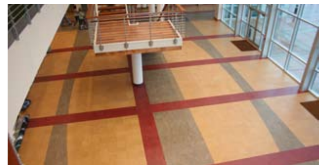
Chattanooga State Technical Community College

The new Wicanders® comfort collections - with a cork look or simply incorporating cork - are notable for their high degree of energy-efficiency, capacity for thermal and acoustic insulation and greater comfort and durability.