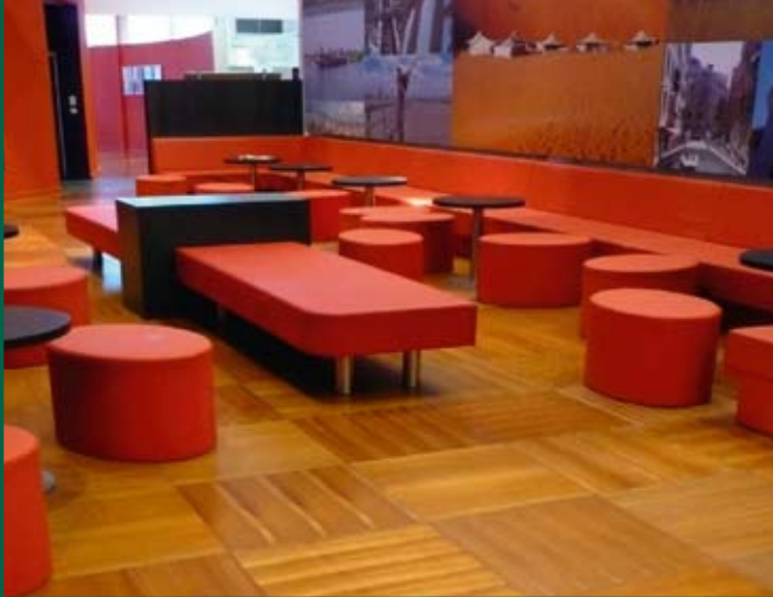
"Brussel Airlines" offices, in Brussels