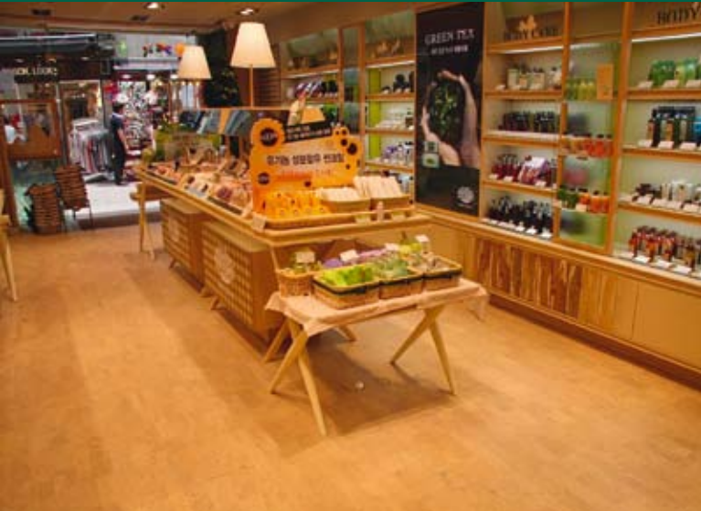
MyeongDong shop, in Seoul

in Innisfree shops and Dongyang apartments in Korea