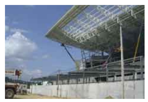
Dolce Vita Coimbra