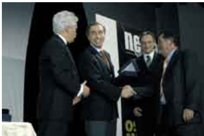
The Research and Development Prize is awarded to Amorim & Irmãos

The magazine dedicated to drinks, restaurants and wine tourism, Néctar, celebrated its 3 rd anniversary on 27 January by holding a Gala at Figueira da Foz Casino. The event included the awarding of several prizes in different categories, among which was the Research Prize, attributed to Amorim & Irmãos.