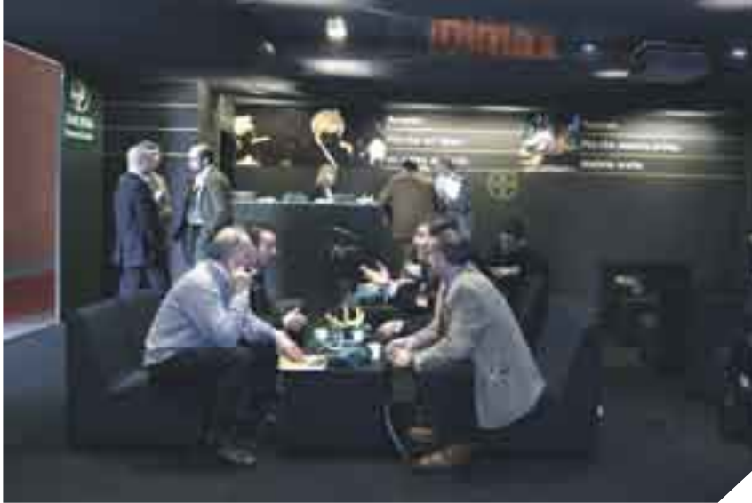
The modern Amorim Cork Italy stand in the latest SIMEI fair, in Milan

Amorim Cork Italy again marked its presence at the world's largest fair specialised in machinery and equipment for winemaking and for producing other drinks, from bottling to selection of the sealer.