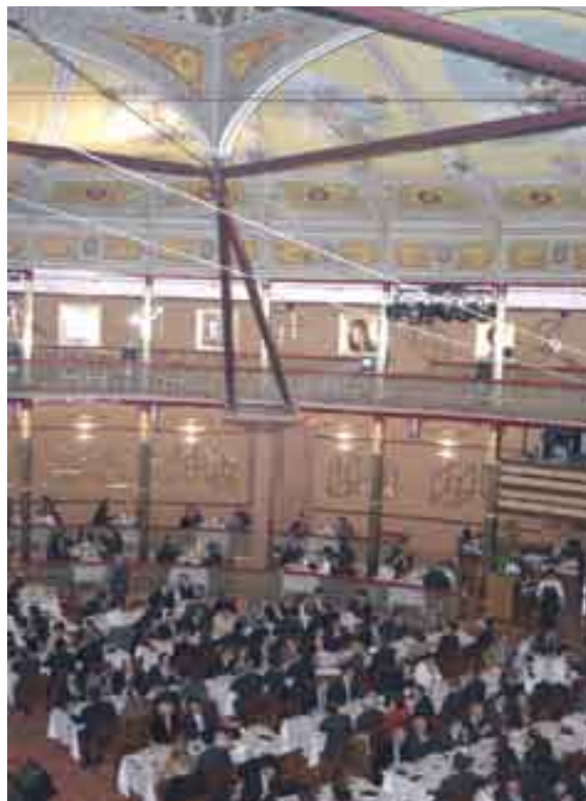
General view of the Main Hall of Figueira da Foz Casino during the 2nd Néctar Magazine Gala

This event, attended by around 400 people, proved a huge success.