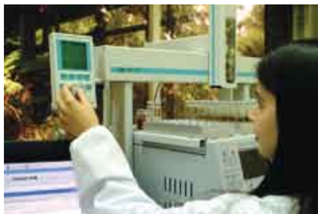
Gaseous chromatography operations in the R&D Department, one of the operational aspects most appreciated by the numerous "opinion makers" that visited Amorim & Irmãos SGPS in 2005.

Coming from dozens of different countries from the five continents, these opinion leaders make an important contribution to the worldwide perception of A&I as an uncontested leader in the wine, champagne and spirit bottle sealing market.