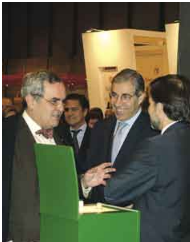
The Portuguese Ambassador in Spain during his visit to the Amorim & Irmãos stand.