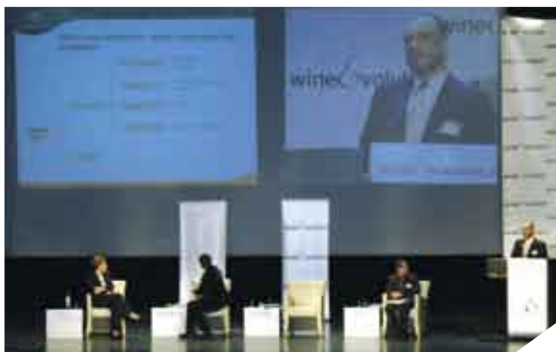
Presentation of Amorim & Irmãos in the 7 th Wine Evolution.

recent marketing and R&D advances in the area of sealers, which was followed by a lively debate on the advantages of cork as the highest quality sealer.