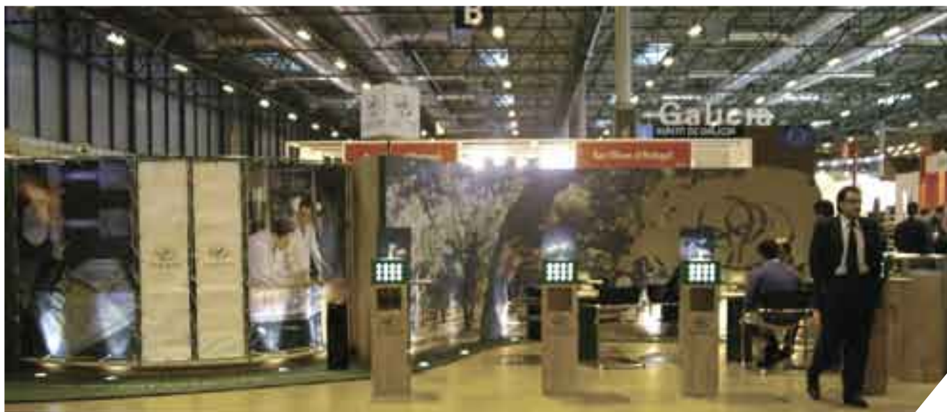
Amorim Stand at Iberwine

Amorim & Irmãos was recently present at Iberwine – International Wine Fair 2005, which was held at the Parque Ferial Juan Carlos I in Madrid.