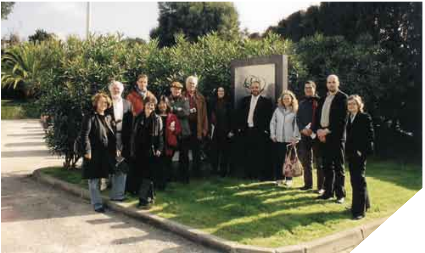
Members from the Institute of Masters of Wine

When an international party of qualified MWs and second-year students at the Institute of Masters of Wine visited Northern Portugal recently, a visit to Amorim&Irmãos was naturally on the cards.