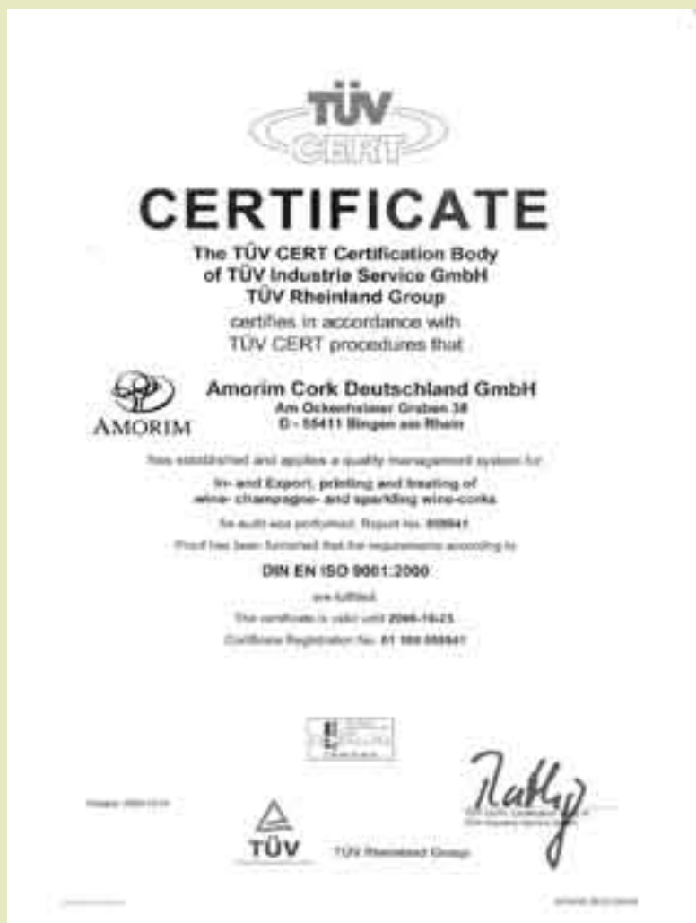
ISO 9001:2000 Certificate