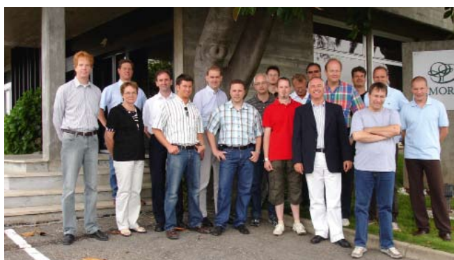
Group from HolzLand

Two committees from two prestigious clients of Amorim Germany came to Portugal at the start of the summer.