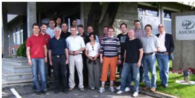
Group from Holzlandel