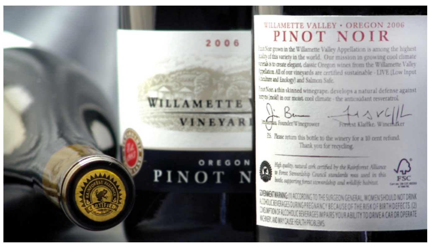
Amorim is the world's first packaging company to receive FSC "Chain of Custody" certification for a natural stopper. Willamette Valley Vineyards now uses FSC-certified cork stoppers supplied by the Amorim Group in all of its bottles

Willamette Valley Vineyards, in Oregon, USA, was recently awarded the FSC (Forest Stewardship Council) "Chain of Custody" certification by the NGO Rainforest Alliance, becoming the first winery in the world to achieve this important distinction. The certification rewards the winery for using stoppers produced from a cork oak forest managed in accordance with the responsibility and sustainability criteria established by the FSC.